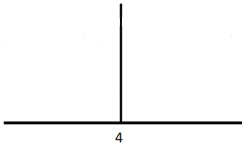
value without uncertainty

In the case of a result of 4 with an uncertainty of \pm 1 :