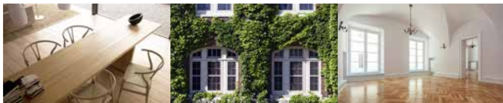
Furnishings and decor